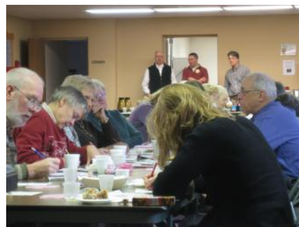
POP Quizzes are serious business!